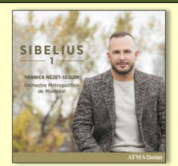
Sibelius: Symphony No. 1 in E minor, Op. 39 – Yannick Nézet-Seguin, Orchestre Métropolitain de Montréal (ATMA Classique)