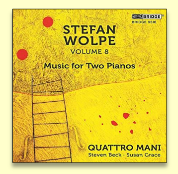
Stefan Wolpe: Music for Two Pianos Performed by Quattro Maini (Bridge Records)

The best is reserved for last: Bach's Partita No. 1 in B Minor, BWV 1002 with its infinite variety and its innovative use of variants known as "doubles" immediately following all four movements. (In Bach's day, the French term implied harmonic, rather than thematic variations.) We have here an uncommonly vigorous Allemanda with double-stops at its very outset, a typically lively Corrente, a slow, expressive Sarabande, and a devilish Tempo di Borea (in the time of a Bourée). The last-named is given an appropriate whirlwind intensity, as Borea can also be taken as a pun on the name of Boreas, the god of the winds in Grecian mythology. As always, Koh handles the musical material with style and dispatch, and no nonsense.