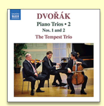
Dvořák: Piano Trios Nos. 1 & 2, Op. 21, 26 The Tempest Trio (Naxos)