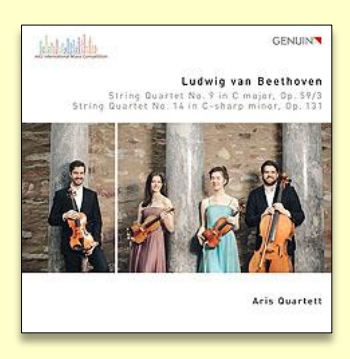
Beethoven: String Quartets Nos. 9, Op. 59/3 and 14, Op. 131 – Aris Quartett (Genuin)