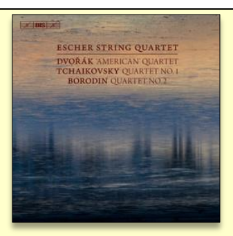
Dvorak, Tchaikovsky, Borodin: String Quartets – Escher String Quartet (Bis SACD)

That last-mentioned requirement is in fact one of the reasons driving Kodály's Concerto for Orchestra (1940), which, I feel, deserves equal stature with Bartók's similarly titled work of 1944. Its three sections are played without breaks, in a work that seems to replicate the form of the baroque concerto grosso in 20th century terms. The opening section, high-stepping featuring dance measures and a fanfare, is succeeded by the intimate Largo section in 3/2 time. This section