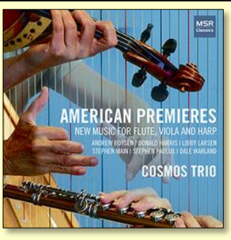
"American Premieres," Music for Flute, Viola, Harp – Cosmos Trio (MSR Classics)

All the suites are set out in the same pattern: Prelude, Allemande, Courante, Sarabande, a "galanterie" or complimentary dance and its